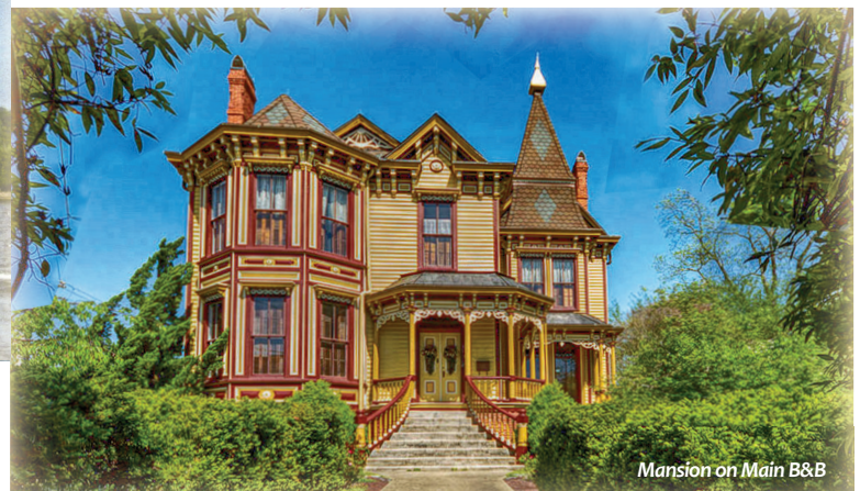
Mansion on Main B&B

A variety of regional dishes can be found in most restaurants with pork and seafood among the favorites...and of course, our world-famous Smithfield Ham!